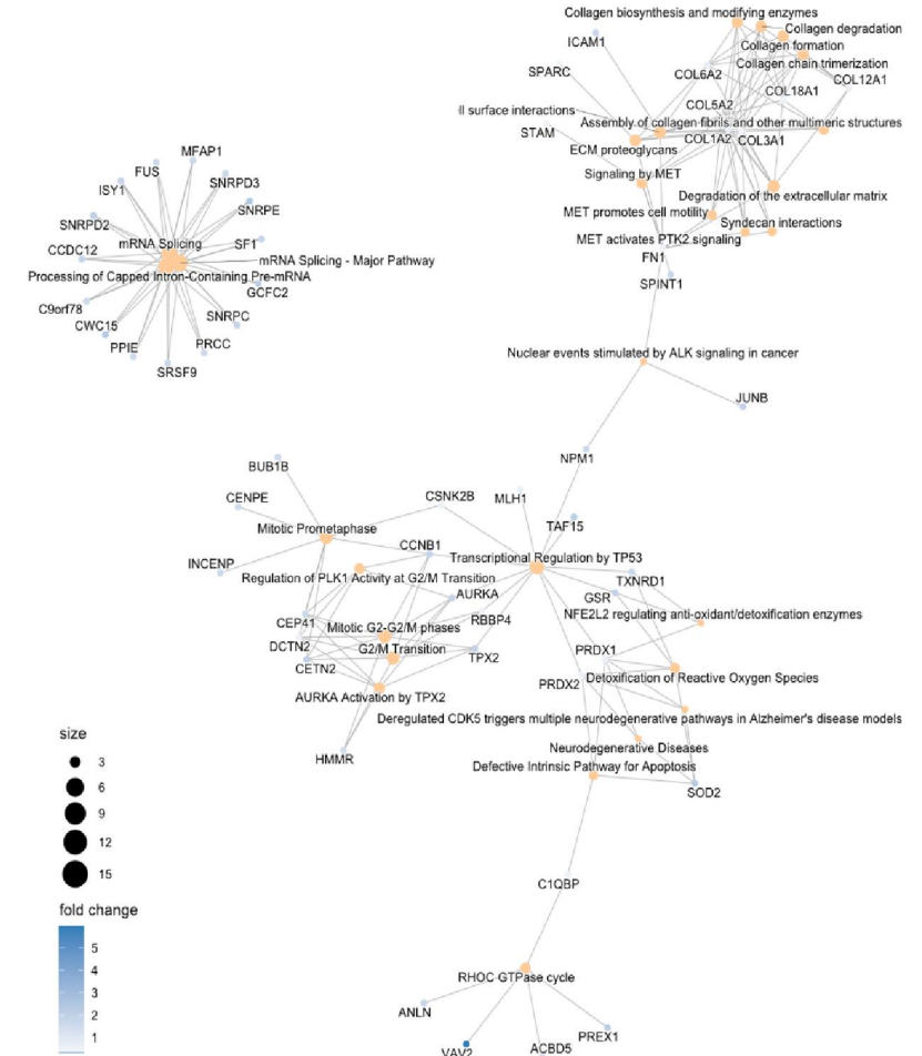
Supplementary Fig. 2. Functional interaction networks of dysregulated proteins identified in HLE-B3 sEVs and cell extracts analyzed with Reactome.