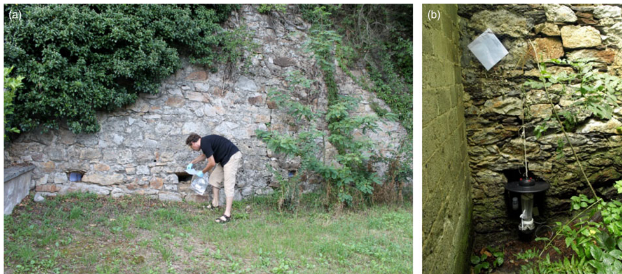
Fig. 7 P. mascittii habitat in (a) Alsace, France and (b) Ticino, Switzerland; combination of light and sticky traps.

inside houses or under leaves. Resting site collections may be the best method for obtaining male sand flies, which are required for the identification of some species. Generally there are no differences between trapping techniques but some modification according to resting place may be needed.