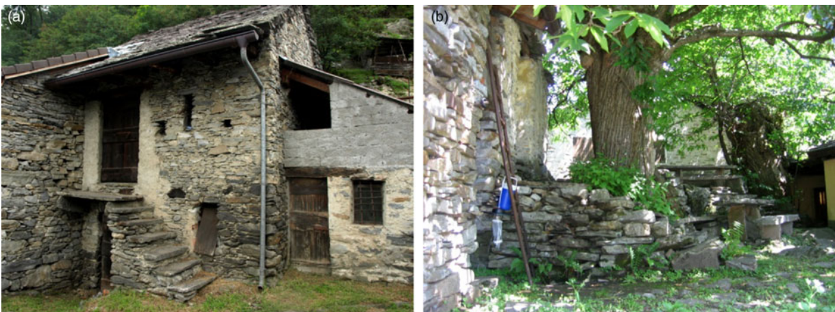
Fig. 6. P. perniciosus habitat (a) in Ticino, Switzerland, (b) CO 2 -baited light trap.