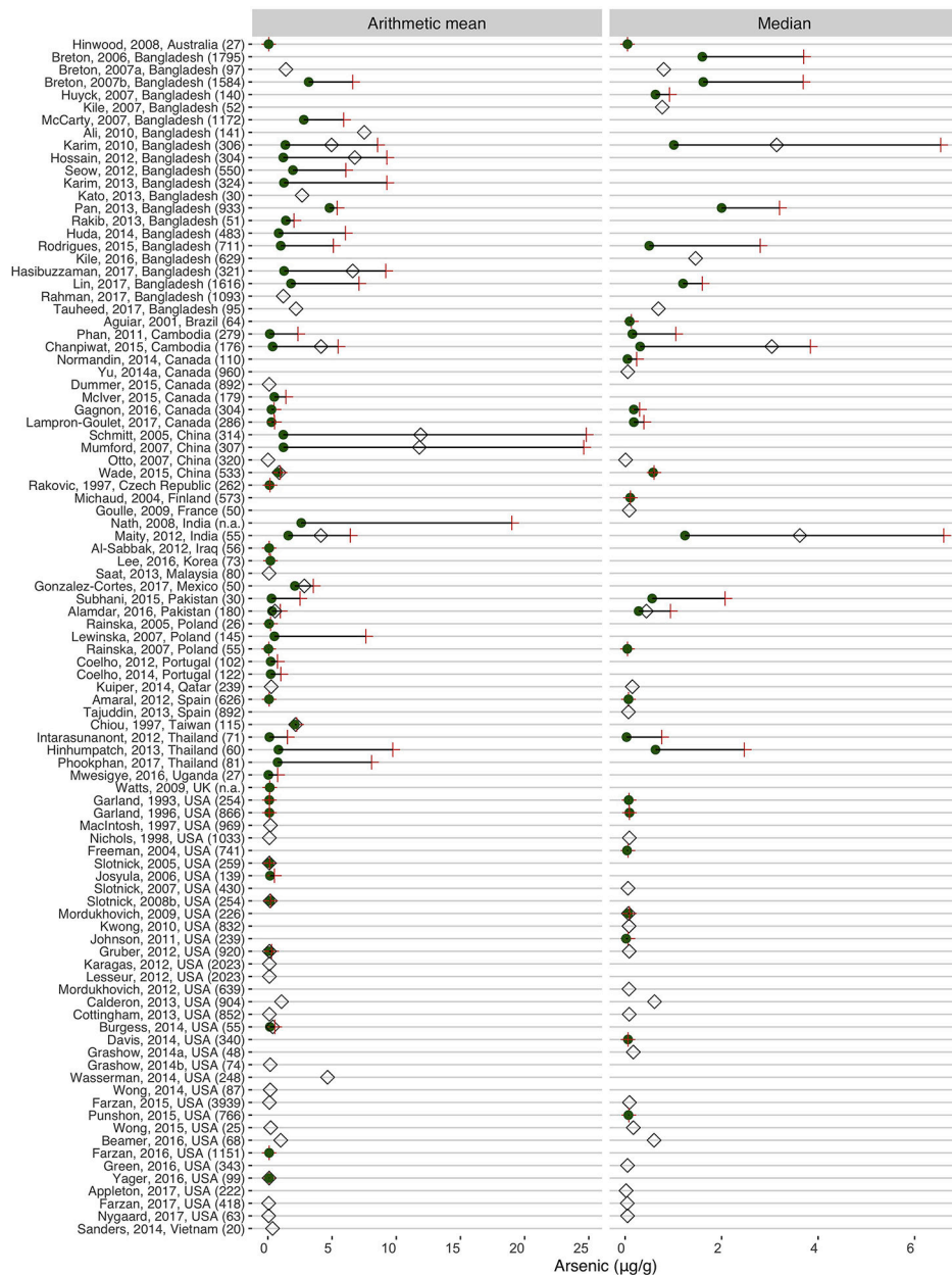
Figure 1: Arsenic concentrations (arithmetic mean or median, \mu\text{g/g} ) in human toenails (1993 – 2017). The green circles and red crosses refer to the minimum and maximum values of toenail arsenic in population subgroups assessed in the reviewed study. The empty rhombus refers to the overall value of toenail arsenic reported in the reviewed study. The number within brackets refers to the overall size of the study population, and when this information is not available (n.a.). The studies are sorted by country, year, and first author's name. UK = United Kingdom; USA = United States of America.